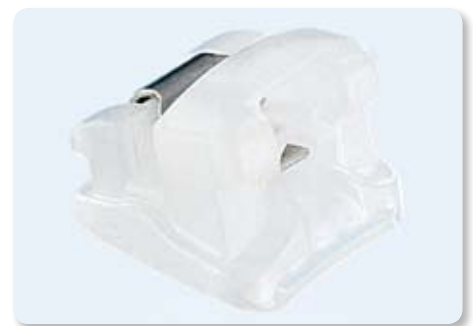
Occluso-gingival edge on the bracket base prevents adhesive flowing into the clip mechanism