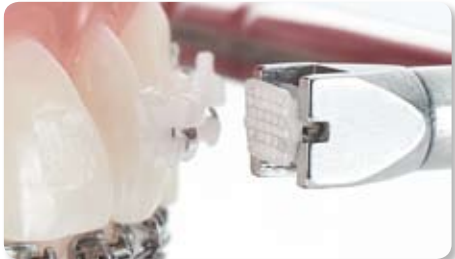
Splinter-proof debonding with the QuickKlear® bracket removing instrument