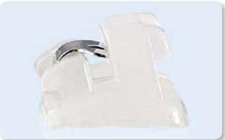
Rounded slot edges and a four contact point slot provide minimal friction