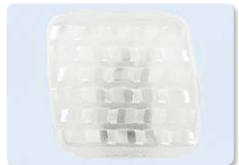
New inverse hook-style base