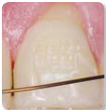
Adhesive remains on the tooth after debonding of the QuickKlear® brackets