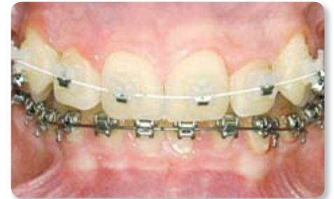
Perfect aesthetics with Titanol® Cosmetic archwires

The precisely rounded slot edges of the QuickKlear® and Quick>>>2.0® brackets even allow the use of tooth-shade coated archwires. To date, these archwires were not recommended for metal and ceramic slots due to their sensitive surfaces. To achieve perfect aesthetics in the maxilla we recommend the use and regular replacement of tooth-shade coated Titanol® Cosmetic archwires - they should not be bent as this may damage their coating. BioStarter® and BioTorque® archwires, recommended for extended intervals or compensatory bending, provide for minimal forces, reduced friction and perfect force transmission.