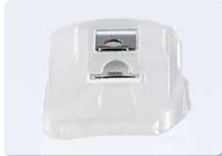
Distinctive funnel for easy opening of the QuickKlear® brackets

gingival aspects. The new guidance channels and a newly developed, distinctive funnel facilitate opening with a probe from the gingival aspect. As previously, the clip can be closed by exerting gentle finger-pressure. The reliable clip made of highly elastic chromium-cobalt alloy is virtually invisible due to its small dimensions.