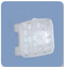
Bracket base after debonding a QuickKlear® bracket